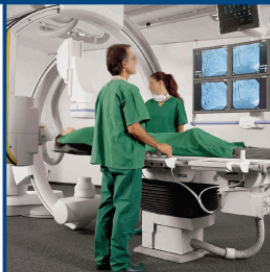
~ Totally Radiolucent Surface ~

FOAM PADS, GEL PADS, VISCO ELASTIC PADS, it is what it is, no matter how great the marketing, you can not change the laws of Physics, Mechanics and/or the Human Hemodynamic System... It's all about Microvascular Blood Flow!!! Without it living tissue dies.